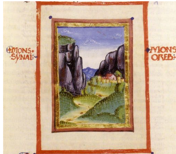
BSB München, Clm 189, fol. 55r